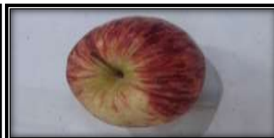
Figure 2: Apple (E)