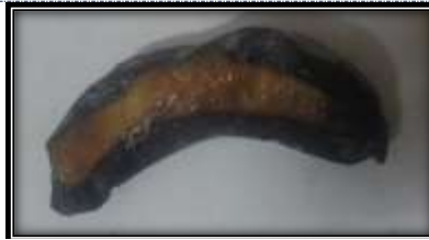
Figure 7: Banana (C) Sliced