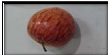
Figure 1: Apple (C)