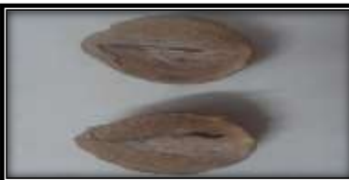
Figure 12: Chikoo Sliced (E)