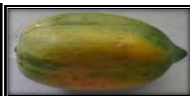
Figure 14: Papaya (E)