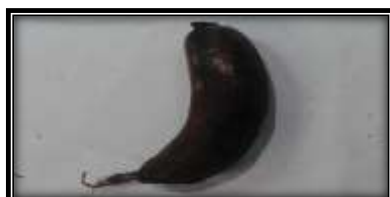
Figure 5: Banana (C)