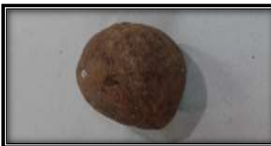
Figure 10: Chikoo (E)