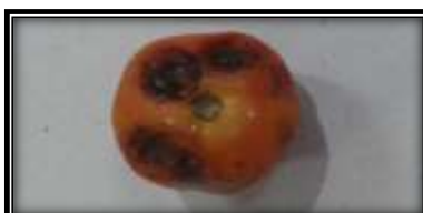
Figure 17: Tomato (C)