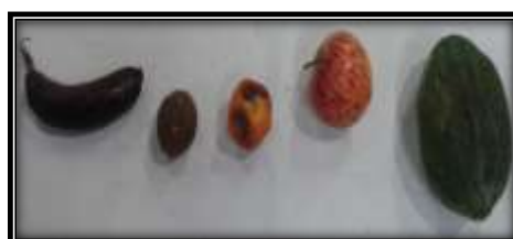
Figure 21: Fruits (C)