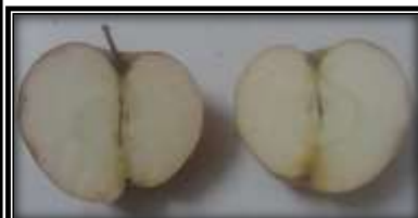
Figure 4: Apple (E) Sliced