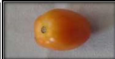
Figure 18: Tomato (E)