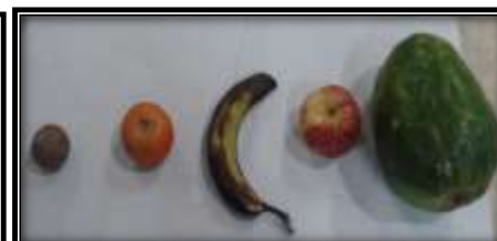
Figure 22: Fruits (E)