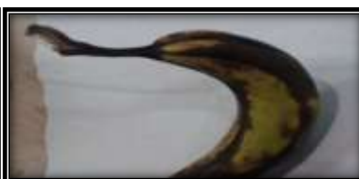
Figure 6: Banana (E)