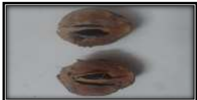
Figure 11: Chikoo Sliced (C)