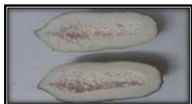
Figure 15: Papaya (C) Sliced