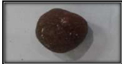
Figure 9: Chikoo (C)