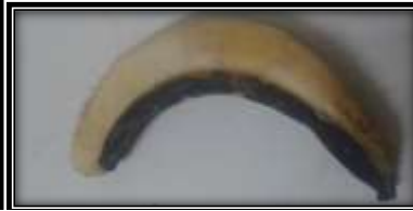
Figure 8: Banana (E) Sliced