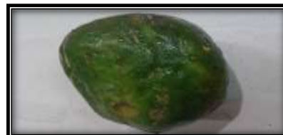
Figure 13: Papaya (C)