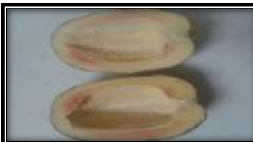
Figure 16: Papaya (E) Sliced