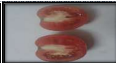
Figure 20: Tomato (E) Sliced