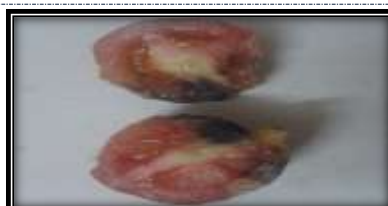
Figure 19: Tomato (C) Sliced